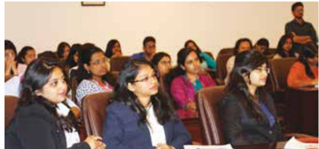
Discerning HR Folks at HR Panel Discussion