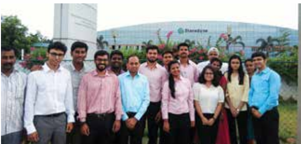
Industrial Visit to Standadyne India on 21st June 2018

Students of XIME-Chennai visited some major industries in the vicinity as a part of the industrial orientation programme.