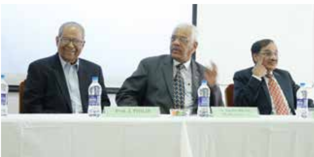
Inaugural of Business Excellence Practitioners' Workshop