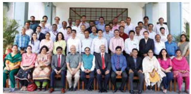
Business Excellence Practitioners' Workshop