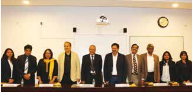
HR Panel Discussion