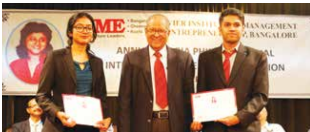
Runners up of debate competition