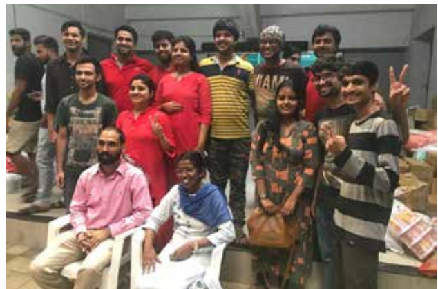
XSEED Army at XIME Kochi