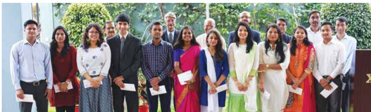
Recipients of Awards and Scholarships