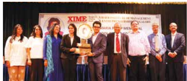
Winners of Debate Competition