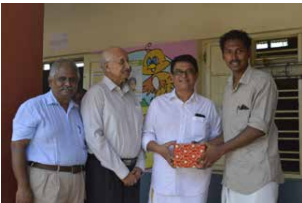
Handover of relief material to Ward Councillor by Secretary and Director