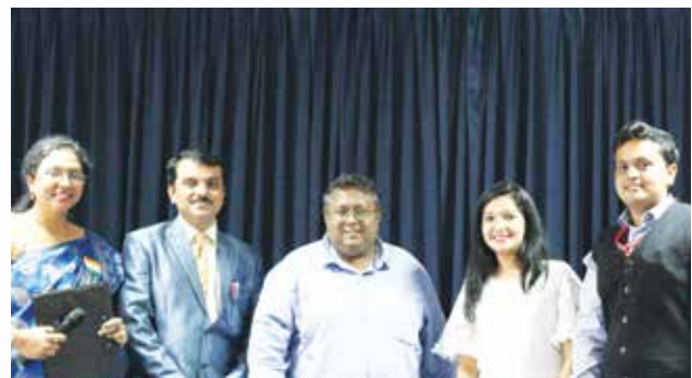
Winners of Music Competition with Panel of Judges