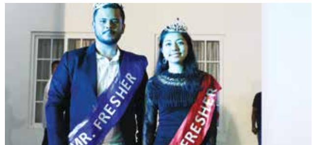
Chennai Batch-II Mr and Ms Fresher